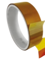
3M™ Lined Low-Static Polyimide Film Tape 5433, Amber