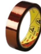
3M™ Low-Static Polyimide Film Tape 5419, Gold