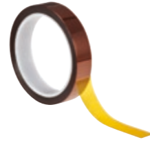
3M™ Polyimide Film Tape 5413, Amber