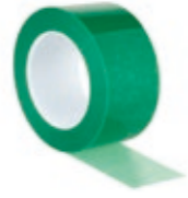
3M™ Greenback Printed Circuit Board Tape 851, Green