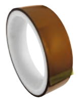
3M™ Low-Static Polyimide Film Tape 7419, Amber